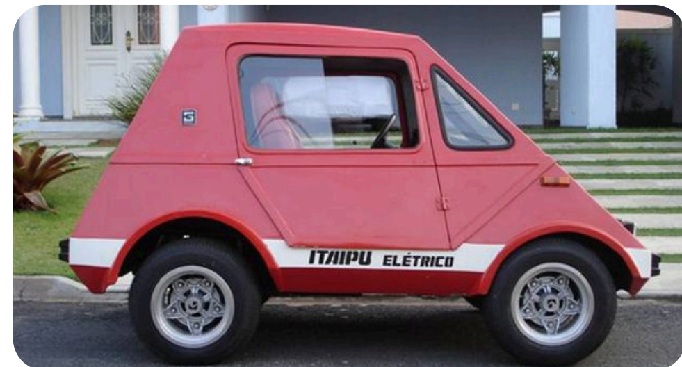
Gurgel Itaipu Electric