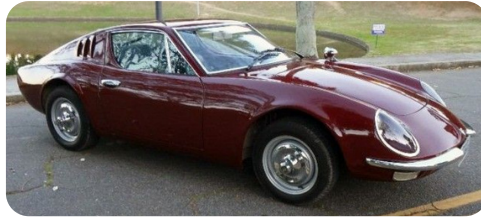
Puma GT 1500