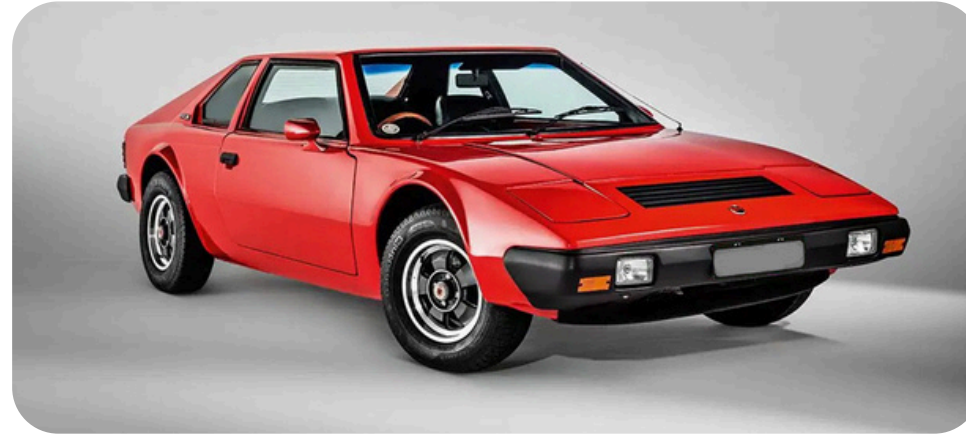
Farus ML 929